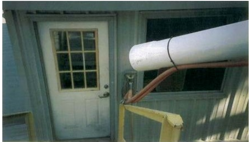
Fiber addition point located near product storage area.

The joint between the intake section and Big Shot should not be glued. This allows for easier disconnection in the event the Big Shot or the intake section needs to be changed or replaced.