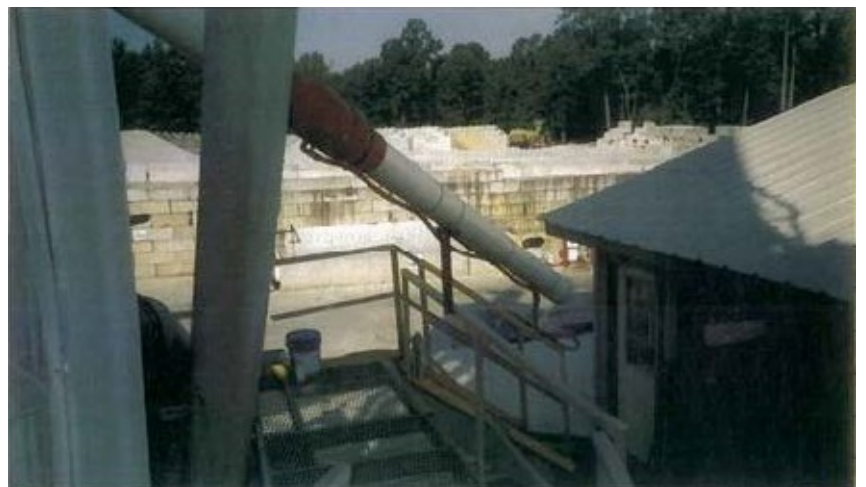
Initial pipe section should be 5 to 10 feet long to create vacuum.