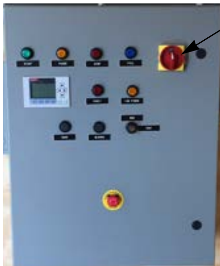
Disconnect switch - main control panel

Make sure that the disconnect switch on the main control panel is OFF. Lock-out the disconnect switch. Use screw driver to open the door of the main control panel.