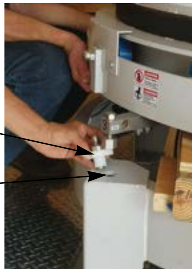
Load cell pad with ball mount Hole in top of leg

While one person lifts a side of the base, the other person must insert a load cell pad into the hole at the top of each leg on that side of the base. Repeat this for the other side of the base so that all four load cell pads are installed.