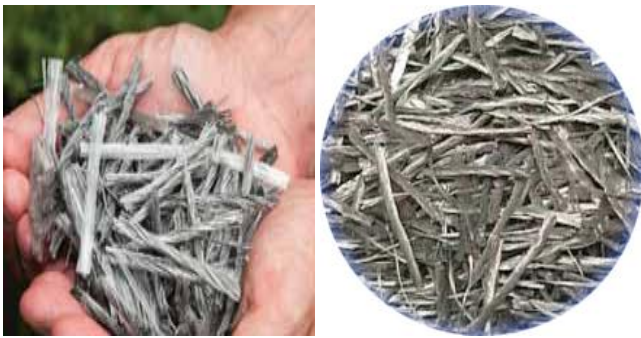
Fig -1: Forta-Ferro Fiber